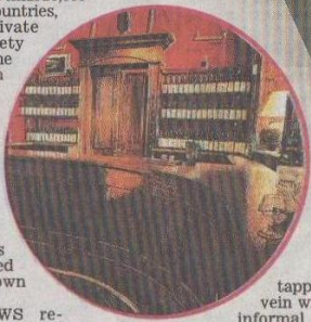
The malt whiskies are identified by numbers and quirky names. The members' room (left; inset) at the society's headquarters in Scotland

tapped a rich vein with their informal initiative—membership grew so fast that in 1983, they formally established SMWS at The Vaults in Leith, Scotland.